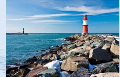
The Baltic Sea